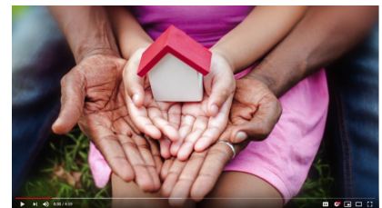
HomeAid Collaborators 2018

In the spirit of Thanksgiving, we'd like to thank all of our incredible partners in the building industry who make our work possible! Watch our new video to see the incredible impact that you help us make for our non-profit partners and their clients each year. Watch here .